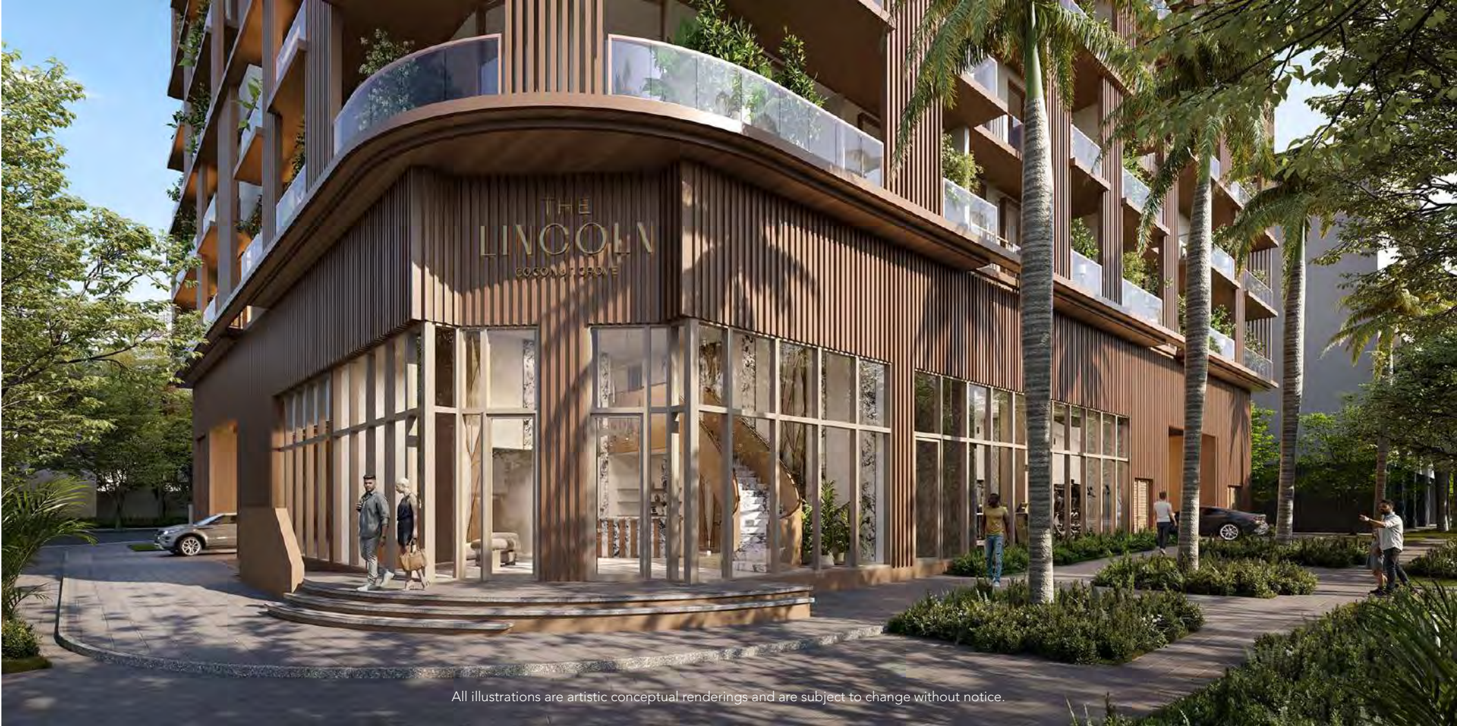
All illustrations are artistic conceptual renderings and are subject to change without notice.