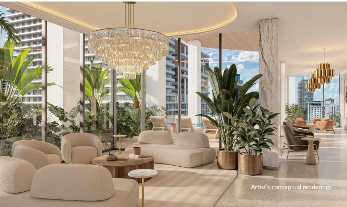
Artist's conceptual renderings