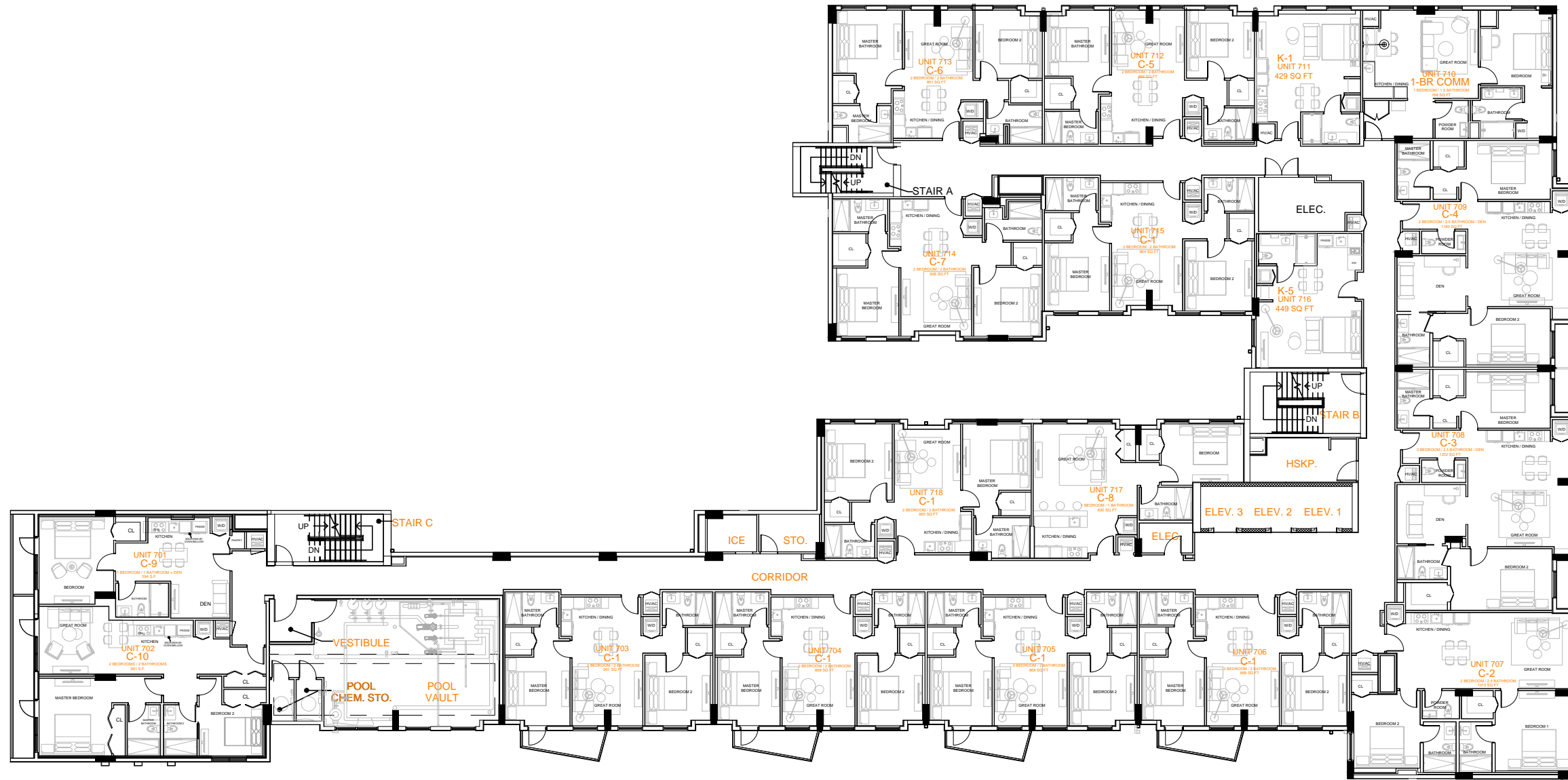
1 LEVEL 7 FLOOR PLAN NOT TO SCALE

NOTE: THE INFORMATION ON THESE PLANS IS FOR CONCEPTUAL PURPOSES ONLY AND IS SUBJECT TO CHANGE. THE AREAS ARE FOR DISCUSSION PURPOSES ONLY AND WILL BE REVIEWED AND ADJUSTED ONCE FINAL APPROVAL BY CITY OF MIAMI.