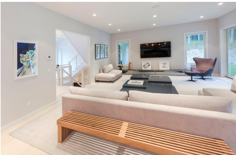
New construction private residence in Amagansett, NY