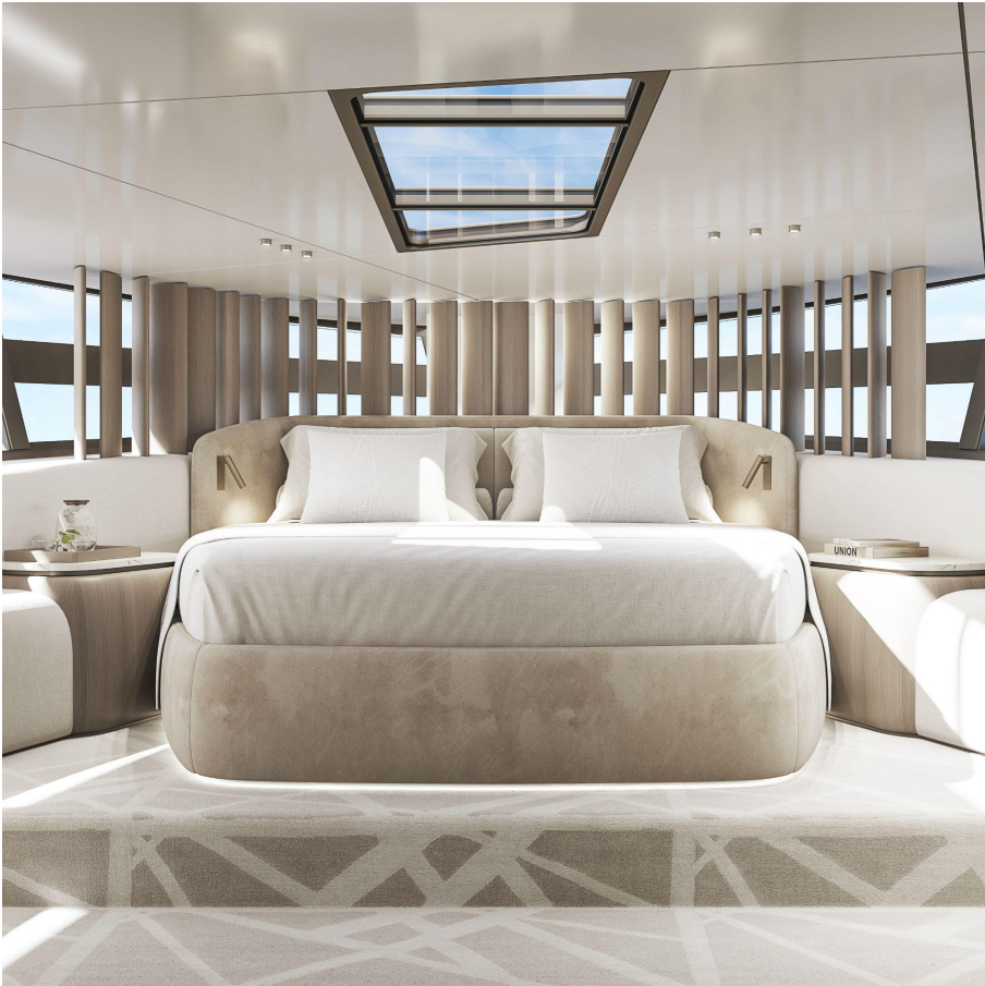
25m Dutch Falcon by Van Der Valk Shipyard