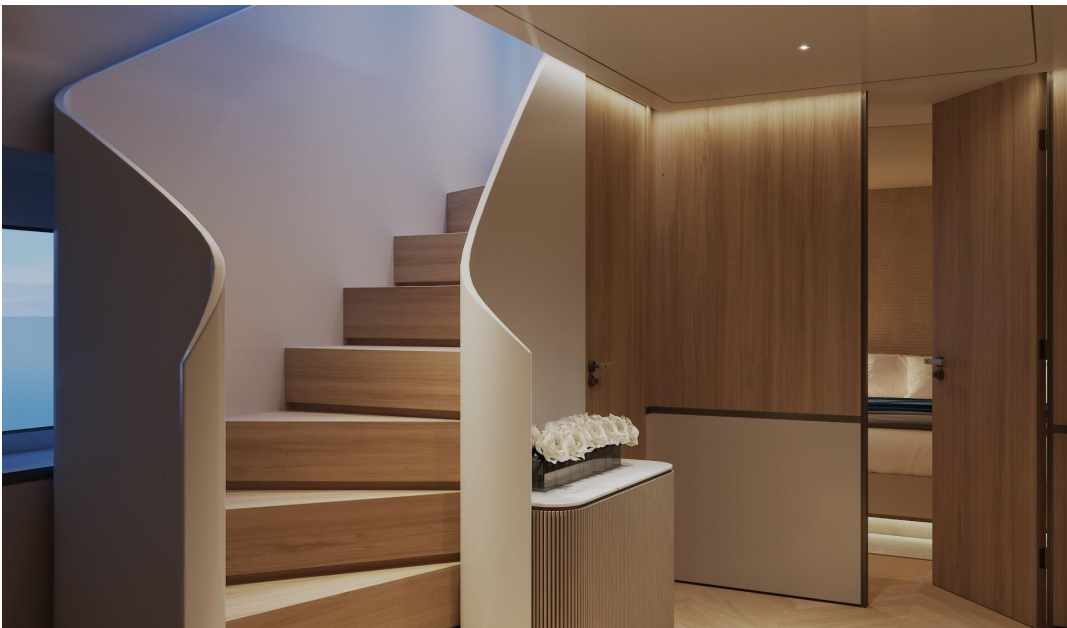
25m Dutch Falcon by Van Der Valk Shipyard