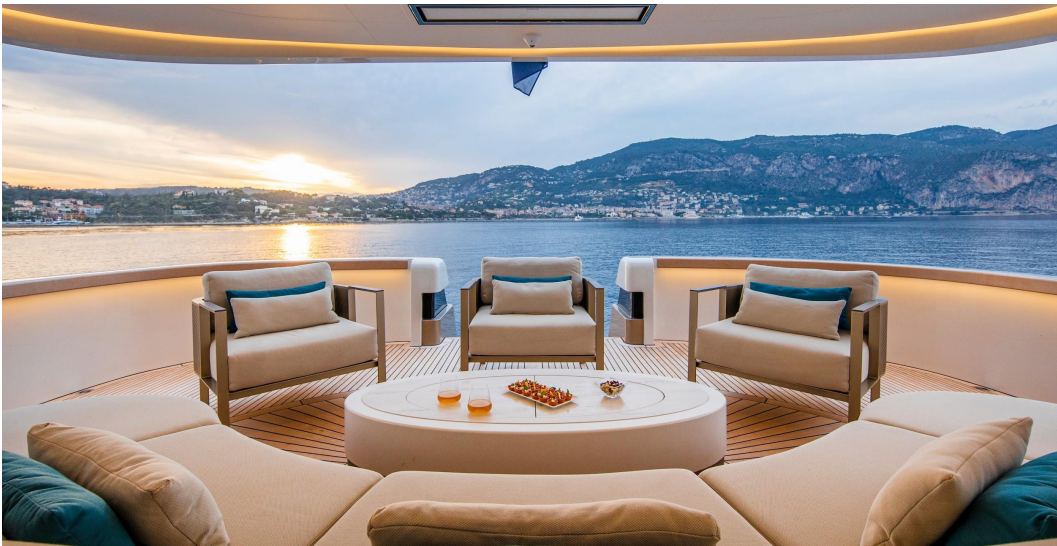
34m M/Y Lady Lene by Van Der Valk Shipyard