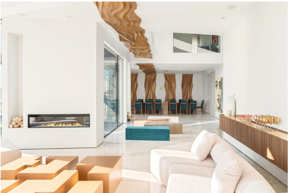
New construction private residence in Great Neck, NY