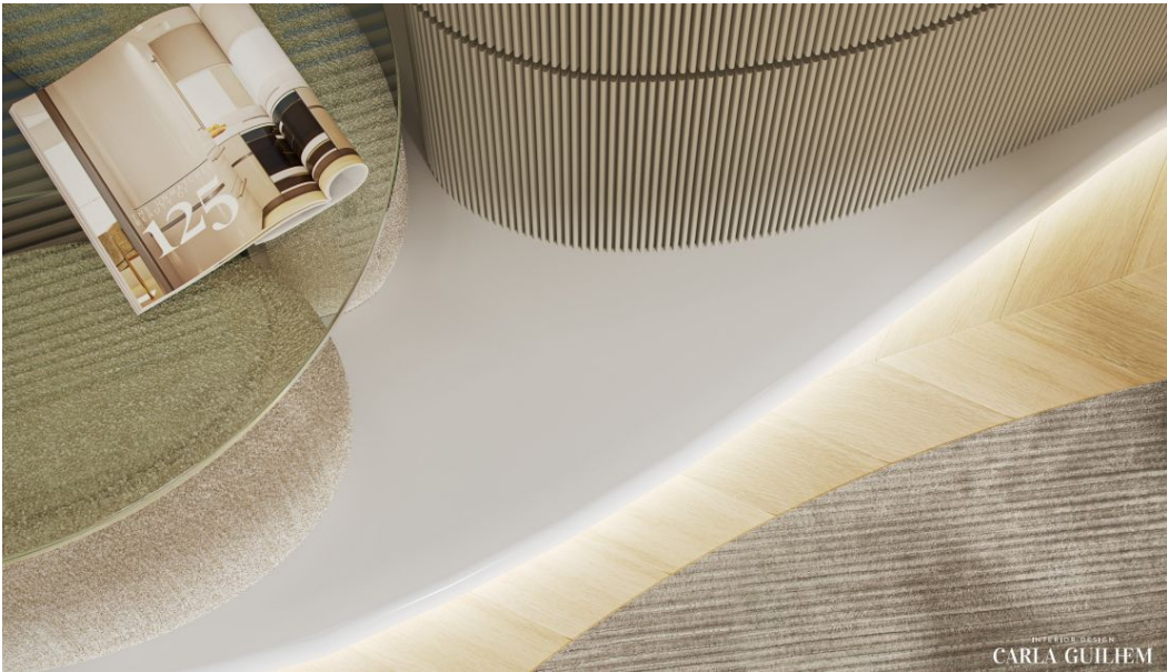
25m Dutch Falcon by Van Der Valk Shipyard