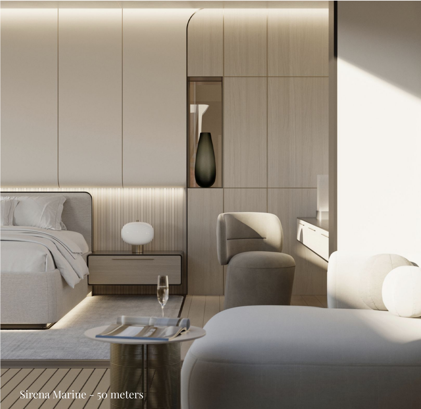
Sirena Marine - 50 meters