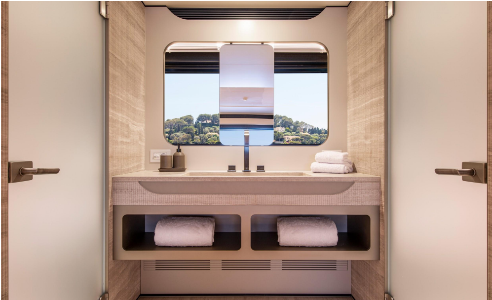
34m M/Y Lady Lene by Van Der Valk Shipyard