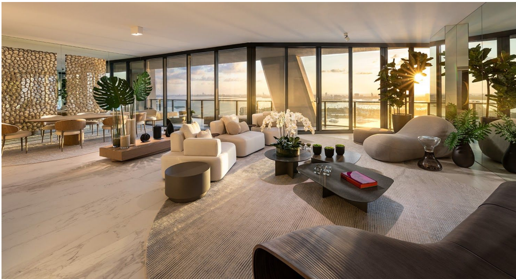
Model unit for Zaha Hadid's One Thousand Museum Miami, USA