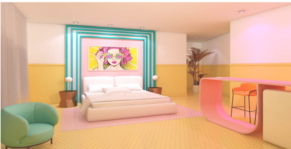
Design study boutique hotel in Miami Beach, FL