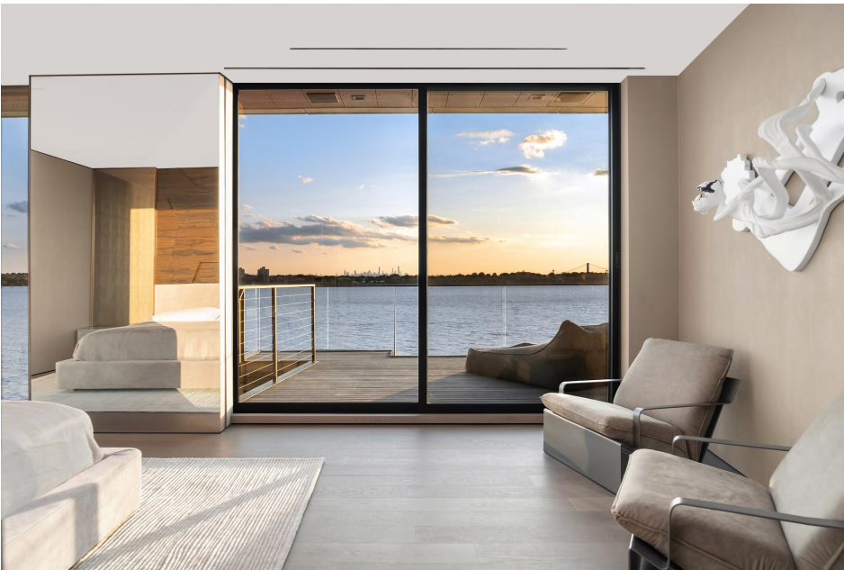
New construction private residence in Great Neck, NY