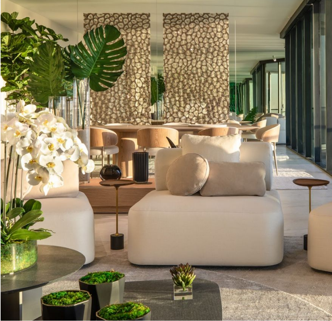
Model unit for Zaha Hadid's One Thousand Museum Miami, USA