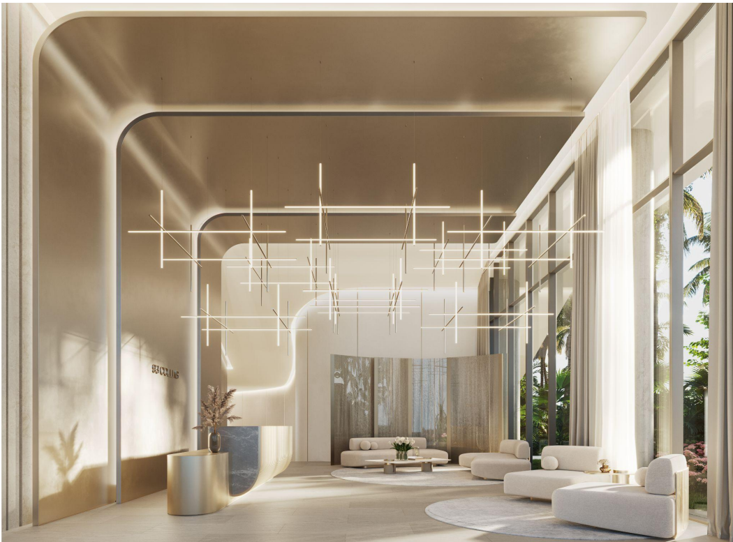
New development, Surfside