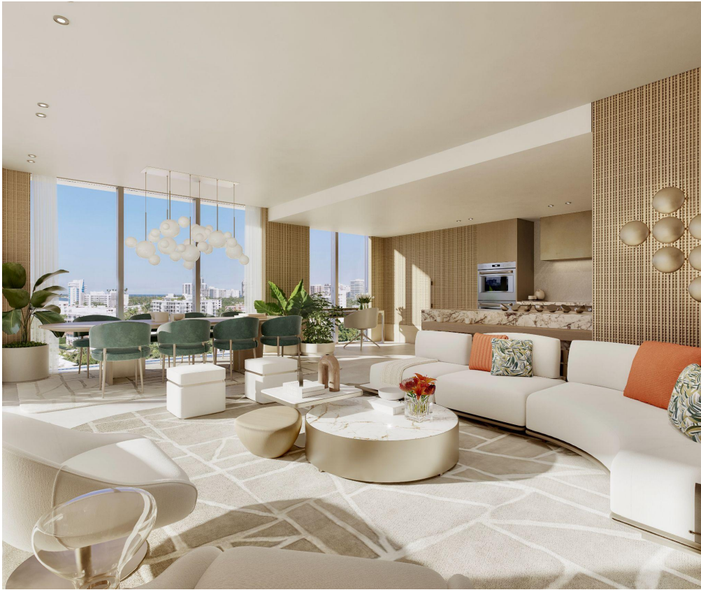
New development, Origin by Artefacto, Bay Harbor, FL