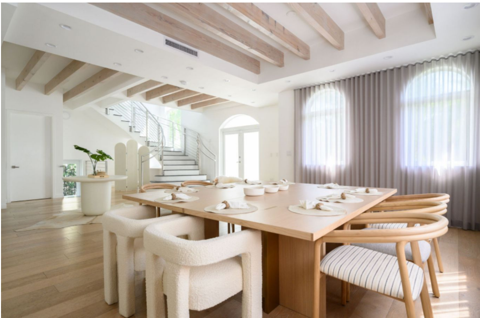
Single-family residence, Miami Beach