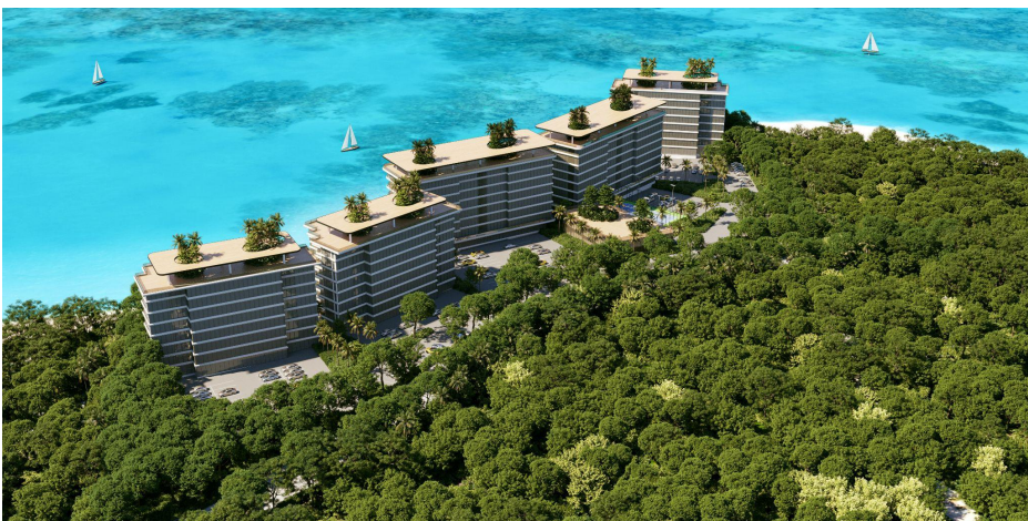
New development, Nassau - The Bahamas