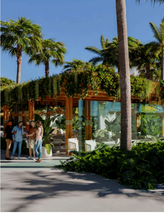
Ladelle's Cafe & Boardwalk