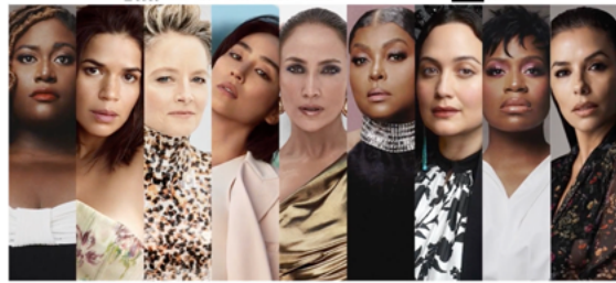
Meet ELLE's 2023 Women in Hollywood